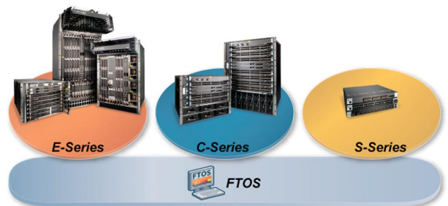
Figure 2. FTOS provides a common interface across Force10's product portfolio of chassis and fixed configuration switch/routers

The modular design of FTOS makes it easy to trace software errors to specific processes and facilitates any required remedial action. Through enhanced serviceability commands, Force10 provides a complete hardware and software diagnostic suite that enables IT to quickly gather debugging information. With a few commands, a network administrator can collect the information needed to analyze and solve a problem, rather than simply reacting to its symptoms.